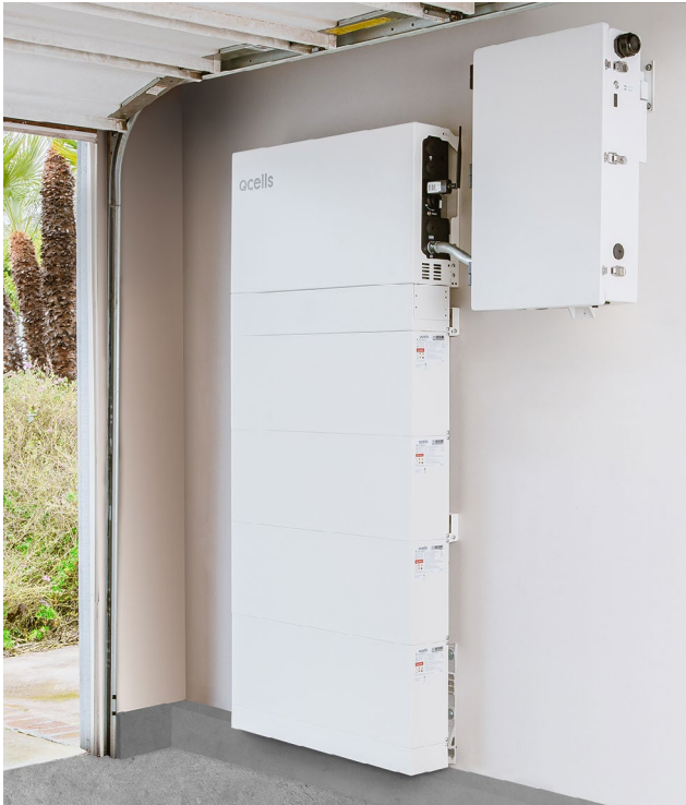
San Diego, CA homeowner installation

The flexibility of Q.HOME CORE enables a wide range of energy storage capacities to power home essentials and heavy loads. With the scalability to expand if your energy needs grow.